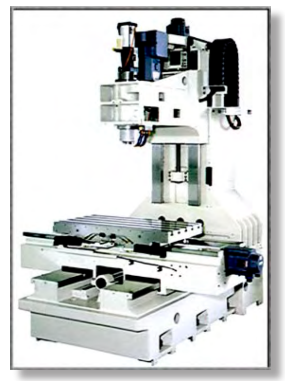
Above is the frame of the TWH-1045 and below with the enclosure fitted.