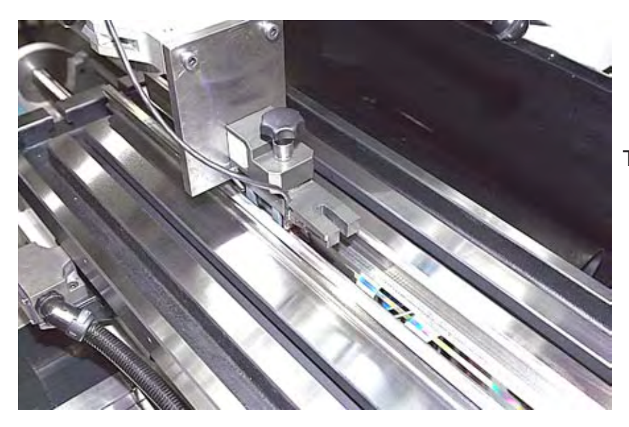
The Heidenhain VLM scale during inspection for positioning and repeatability.