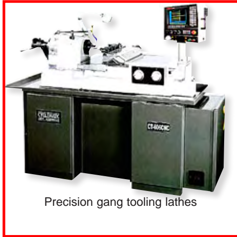
Precision gang tooling lathes