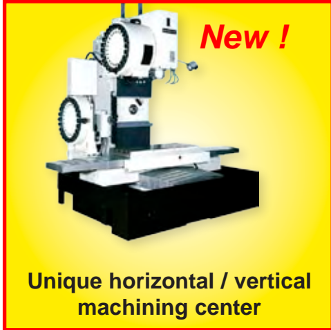
Unique horizontal / vertical machining center