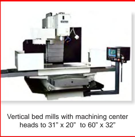
Vertical bed mills with machining center heads to 31" x 20" to 60" x 32"