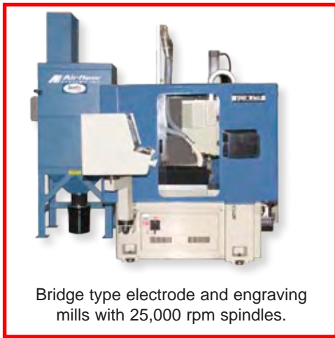
Bridge type electrode and engraving mills with 25,000 rpm spindles.