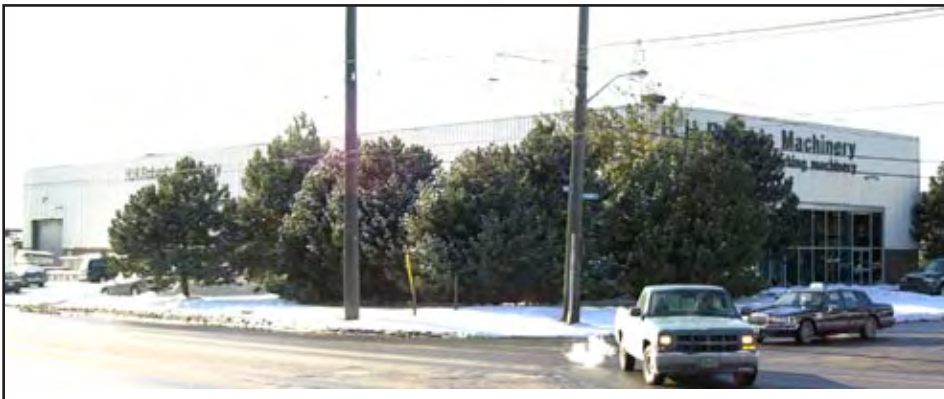
Our current location, 5 minutes from the Toronto International Airport

The TW-50-RH with servo feeds on all 3 axes, 15 Hp spindle drive and 2,000 lb table load.