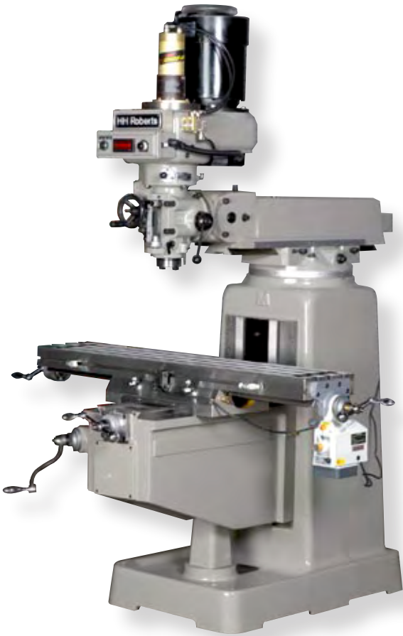
The 3-GL shown with optional power draw bar, but without the standard chip protectors.