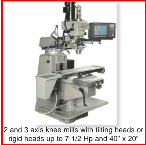
2 and 3 axis knee mills with tilting heads or rigid heads up to 7 1/2 Hp and 40" x 20"