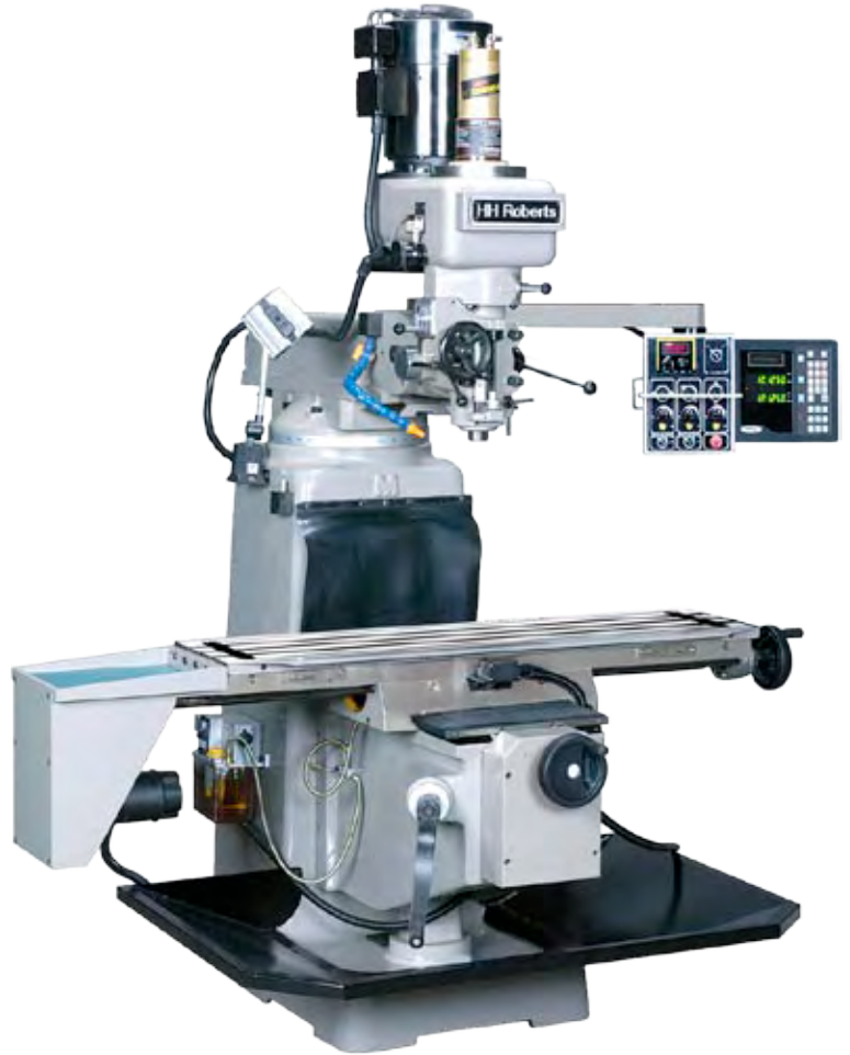
The 4-VF with the standard Fagor digital readout. In this picture the telescopic steel chip guards are not yet fitted on the cross slide. The power drawbar shown is optional. The telescopic guards can be seen in the 5-VF pictures on page 6