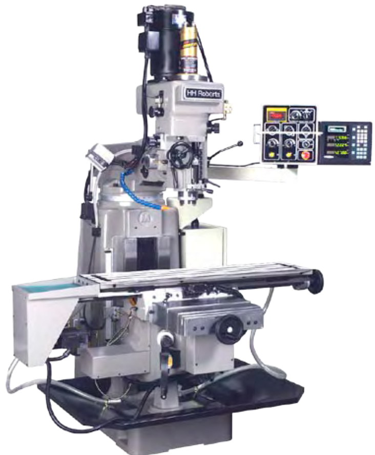
The 5-VF shown with the Fagor digital readout and optional power draw bar.