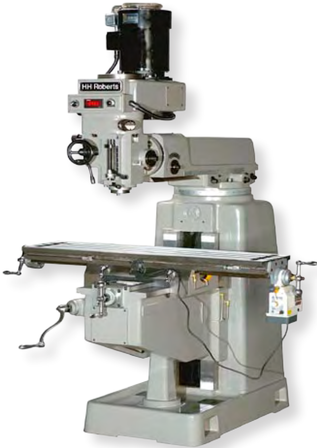
The 5-GL shown with all standard equipment.