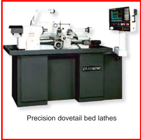
Precision dovetail bed lathes

Our products are continuously developing and specifications change frequently. It is suggested that you reconfirm any critical specifications at the time of order.