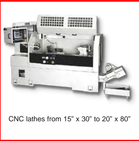
CNC lathes from 15" x 30" to 20" x 80"