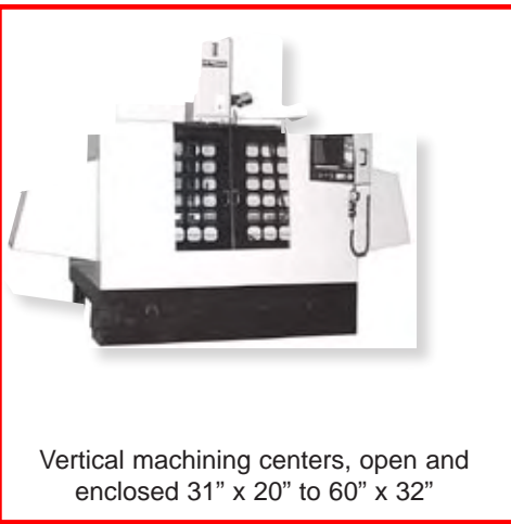
Vertical machining centers, open and enclosed 31" x 20" to 60" x 32"