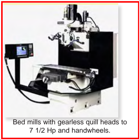
Bed mills with gearless quill heads to 7 1/2 Hp and handwheels.